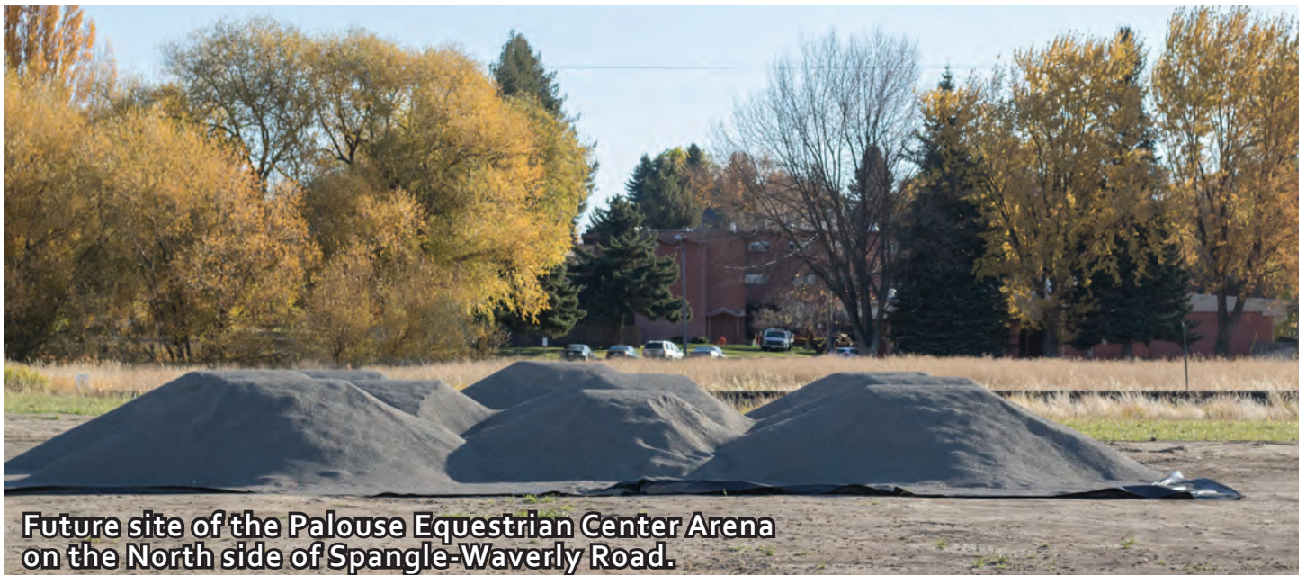
Future site of the Palouse Equestrian Center Arena on the North side of Spangle-Waverly Road.