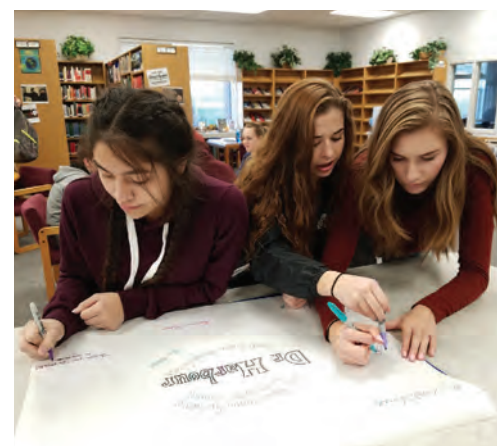
Students note gratitude for the investment in their health and strength.