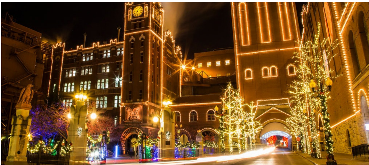
The Anheuser-Busch Brewery in St. Louis relit its holiday light display.