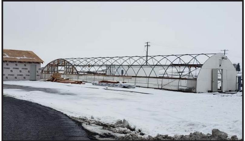
On February 1, for the second time during its life at UCA, high winds damaged the greenhouse cover. A new cover will be installed, and the greenhouse will transition to soil-based agriculture.

Overall, Choral Festival was a great time despite the long time standing. It was a good opportunity to learn at a university level and make new friends.