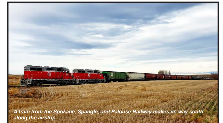
A train from the Spokane, Spangle, and Palouse Railway makes its way south along the airstrip

This schedule is the beginning of a new UCA era, an era in which a different schedule is no longer needed every other day.