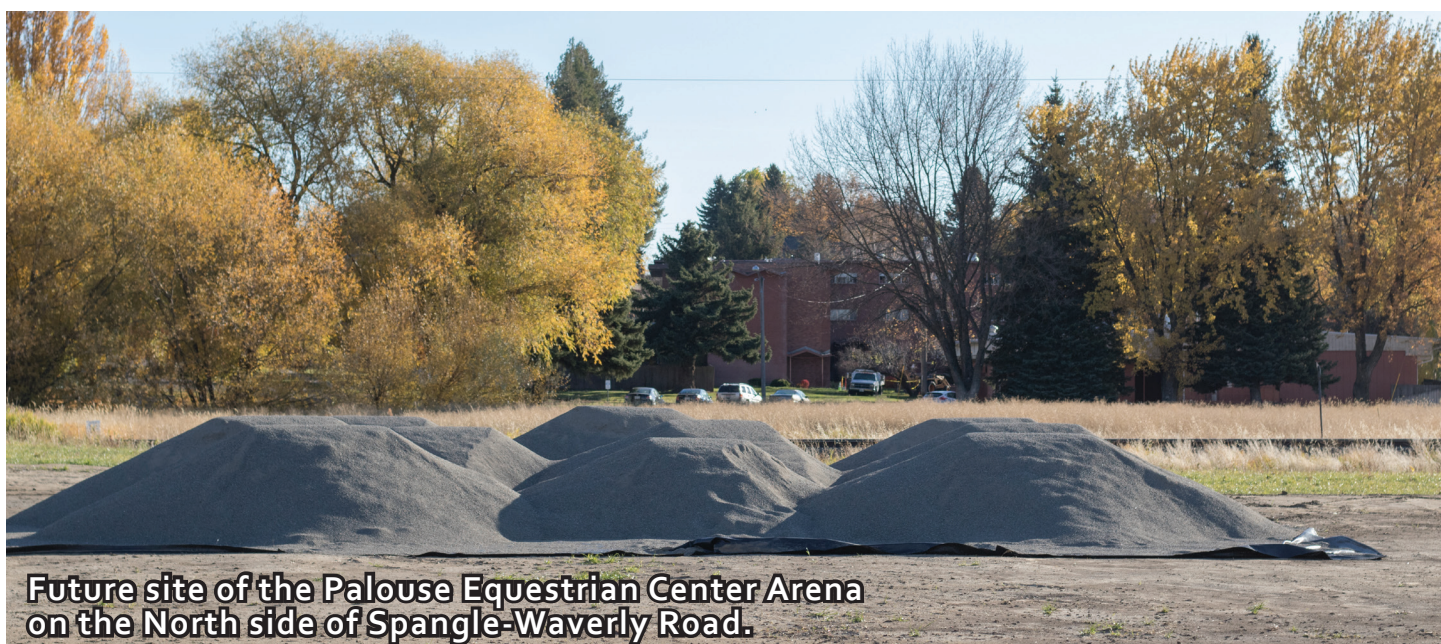
Future site of the Palouse Equestrian Center Arena on the North side of Spangle-Waverly Road.